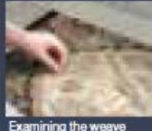
Examining the weave