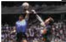
Maradona's 'hand of God' 1986 World Cup